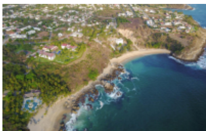
2 - San Juan Teotihuacán - Zimapan - Teotihuacán - La Gloria - Zimapan