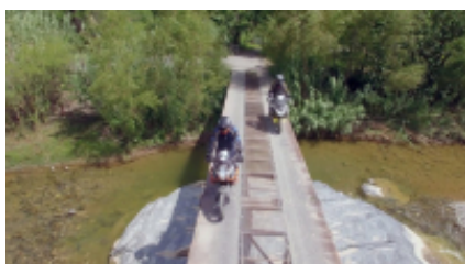
4 - Xilitla - Ciudad Valles - Xilitla - Sótano - Tamul - Ciudad Valles