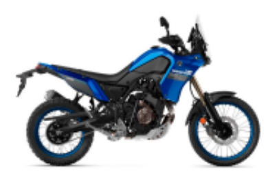
Tenere 700 + $372.62