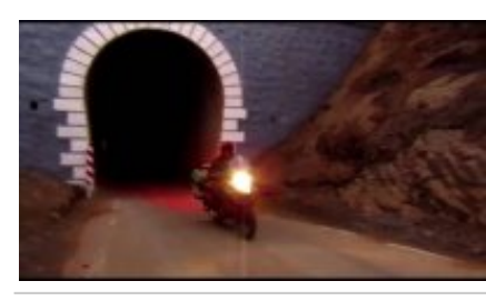
2 - Illapel - Santiago - 290 Return to Santiago by Route 5 with stop in Los Vilos or Pichidangui

1 - Santiago - Illapel - 280 Almost 300 kilometers of driving on slopes and curves in the middle of a foothill landscape going to Illapel.