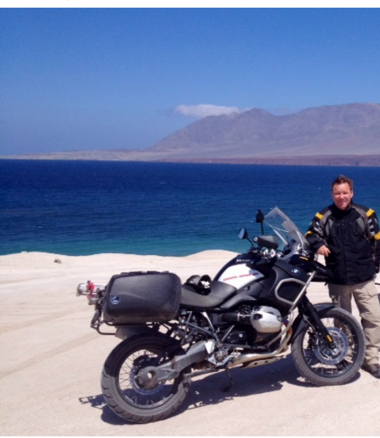
Motorcycle dual-purpose and Adventure Chile, Tunnel's Route