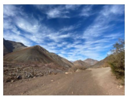
3 - Pisco Elqui - Santiago - 310 Return to Santiago by Route 5 with arrests in Huentelauquén, Canela wind farm, Los Vilos or Pichidangui