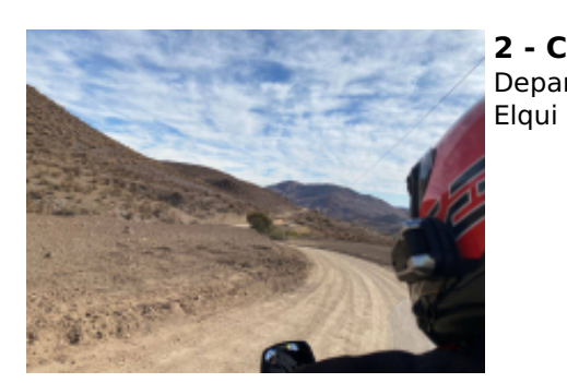
2 - Combarbalá - Pisco Elqui - 220 Departure to Pisco Elqui at 9:00 Arrival approx at 16:30 Acomodation in Pisco