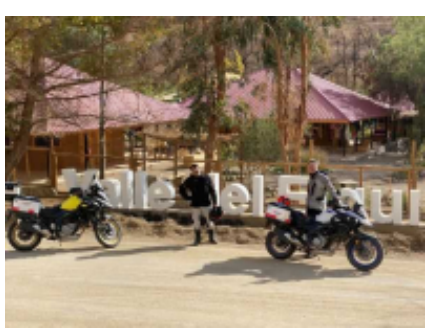
1 - Santiago - Combarbalá - 240 Departure from Santiago 8:30 Arrival in Combarbalá approx 16:30 Accommodation in Combarbala