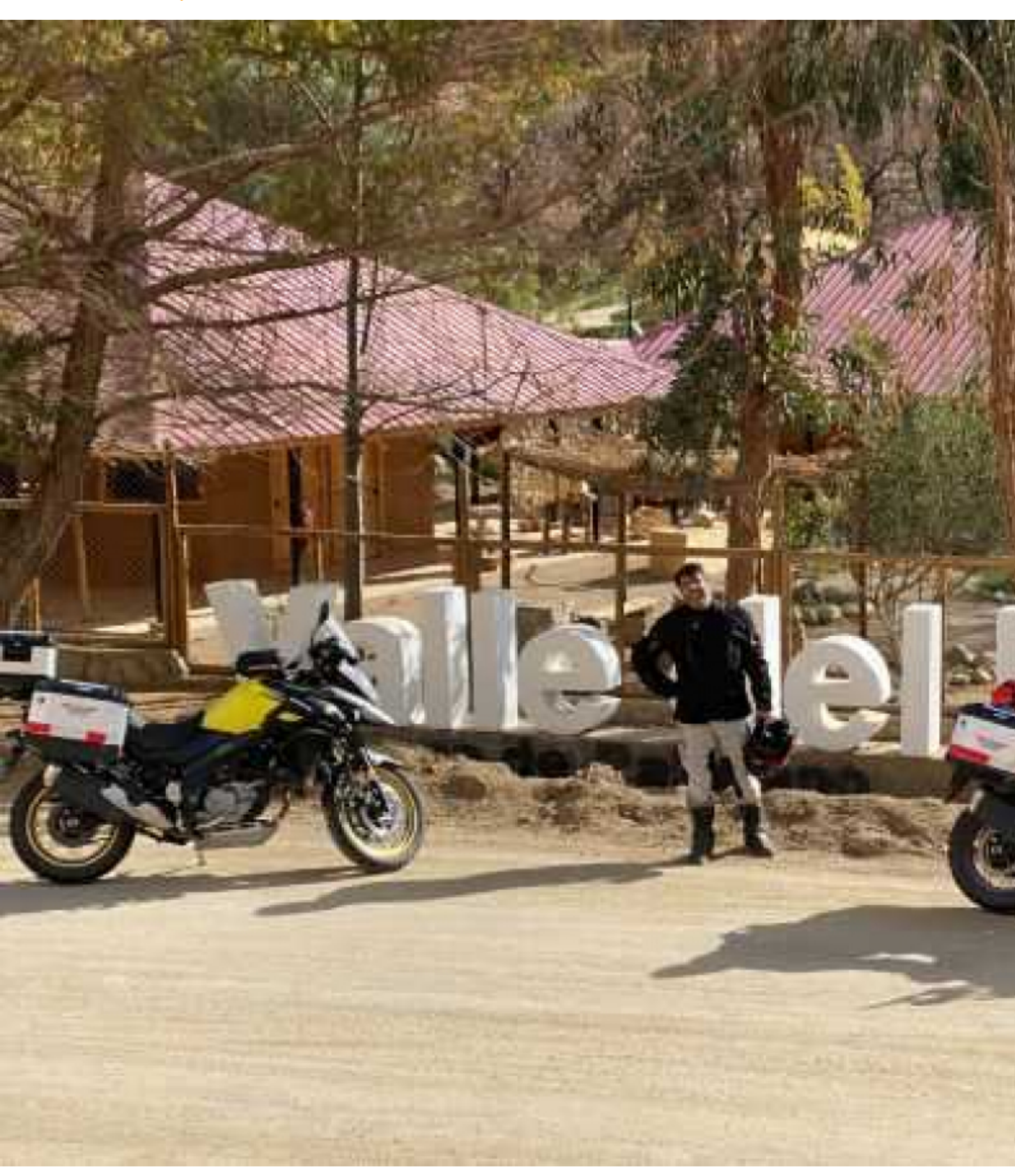
Motorcycle dual-purpose and Adventure Chile, Antakari route