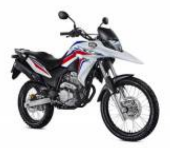
XRE 300 Rally + $0.00