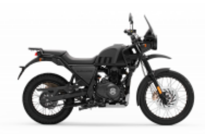
Himalayan 400 + $0.00