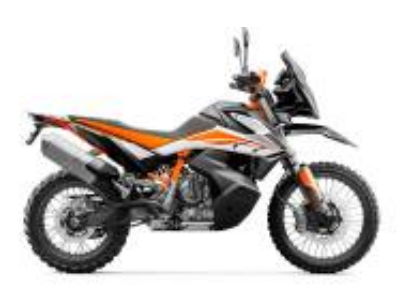
790 Adventure + $720.00