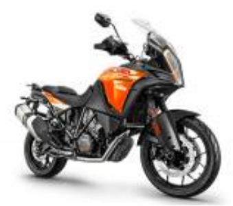
1290 Adventure S + $880.00