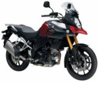
DL 1000 V Strom + $0.00