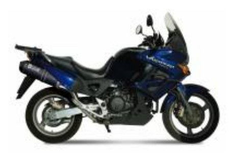
XL Varadero 1000 + $0.00