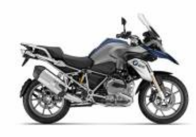
R 1200 GS + $0.00