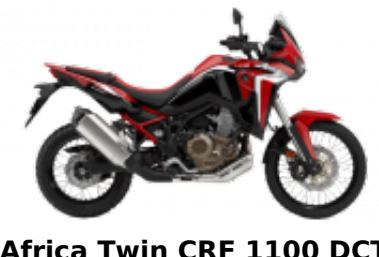
Africa Twin CRF 1100 DCT + $0.00