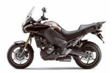
Versys 1000 + $0.00