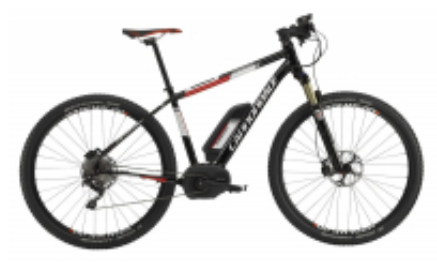
29" Tramont 2 + $43.87