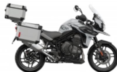
Tiger 1200 Alpine Edition + $2,190.45