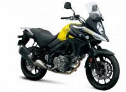
DL 650 V Strom + $200.00