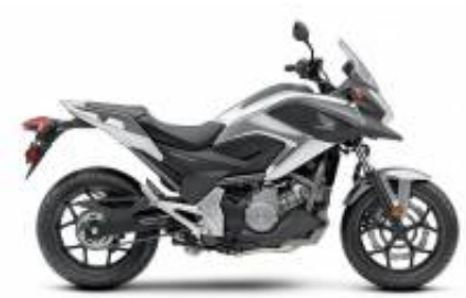
NC 750 X + $0.00