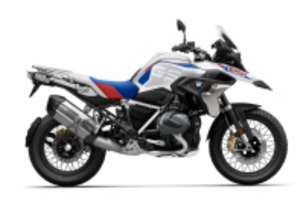
R 1250 GS + $0.00