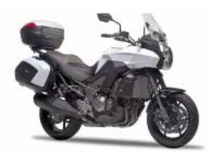
Versys 1000 Grand Tourer + $0.00