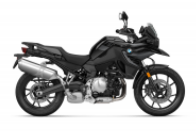
F 750 GS + $0.00