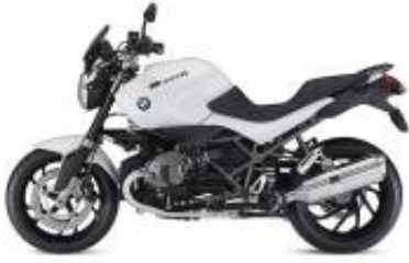
R 1200 R + $647.27