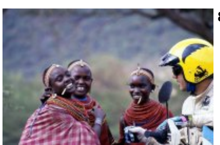
8 - Maji Moto - Nairobi - 140 km