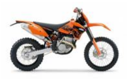
EXC 250 + $670.97