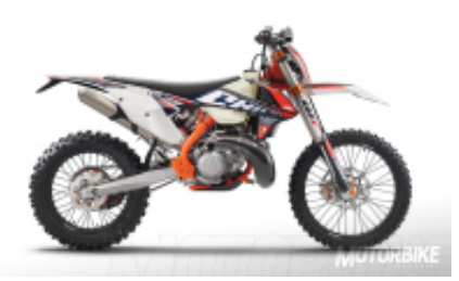
300 2T six days + $670.97