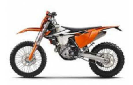
EXC 350 + $670.97