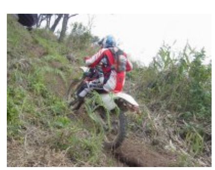
5 - Tabanan - Tabanan -