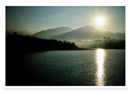
4 - Negara - Tabanan -