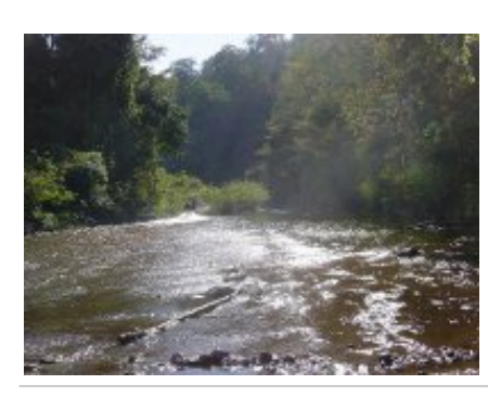
1 - - Nusa Dua -