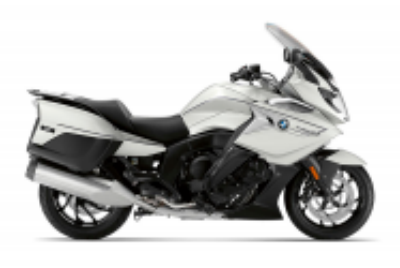
K 1600 GTL + $657.57