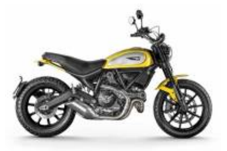
Scrambler Icon 800 + $273.99