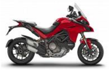
Multistrada 1260 + $547.98