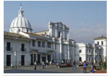
4 - San Agustín - Popayán - 210

We will have the unique experience to cross the Magdalena River in a small canoe departing early in the morning, in our way trees will make a sealing over the road, making riding through on a Royal Enfiel Classic 500 a real pleasure. We will go up to the Colombian Flowerbed to the origin of the Colombian mountain range and its rivers and spend the night in San Agustin, place of the archeological park a world heritage site (UNESCO).