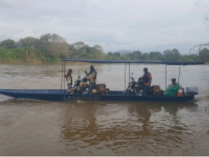
5 - Popayán - Guadalajara de Buga - 180

A less travelled road enjoyable by motorcycle that passes through Purace Natural park, with volcanoes (11) and the "Pan de Azucar" at 5000 meters above sea level, Purace at 4780 meters above sea level and the Coconuco at 4600 meters above sea level. Long off road paths with abundant highland vegetation. In the afternoon we will reach the Colombian colonial white city of Popayan.