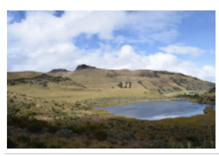
Day 7 Resting day at Salento

During this day riders will choose from different activities (Enjoys the coffee park, tour on Willis Jeep, visiting Cocora park, a butterfly farm, Muleteer museum or stay and do craft shopping in Salento town).