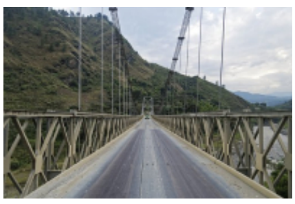
2 - Girardot - Deserto de Tatacoa - 200

Shuttle from hotel to a place outside Bogota. Staff and crew presentation, documentation inspection and route talk. Departure to Girardot. Climate will change from the Cold Bogota to a hot 38 degrees Celsius in Girardot. 5 hour ride with a 90% of asphalt.