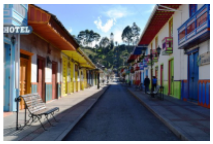
6 - Guadalajara de Buga - Salento - 150

After a short walk through the city, the road will lead us to the warm valley of the Cauca River, towards Silvia, a picturesque and representative South American Andes Indian tribe. WE continue our ride through the valley filled with crops and plantations till we reach the Colonial and religious city of Buga.