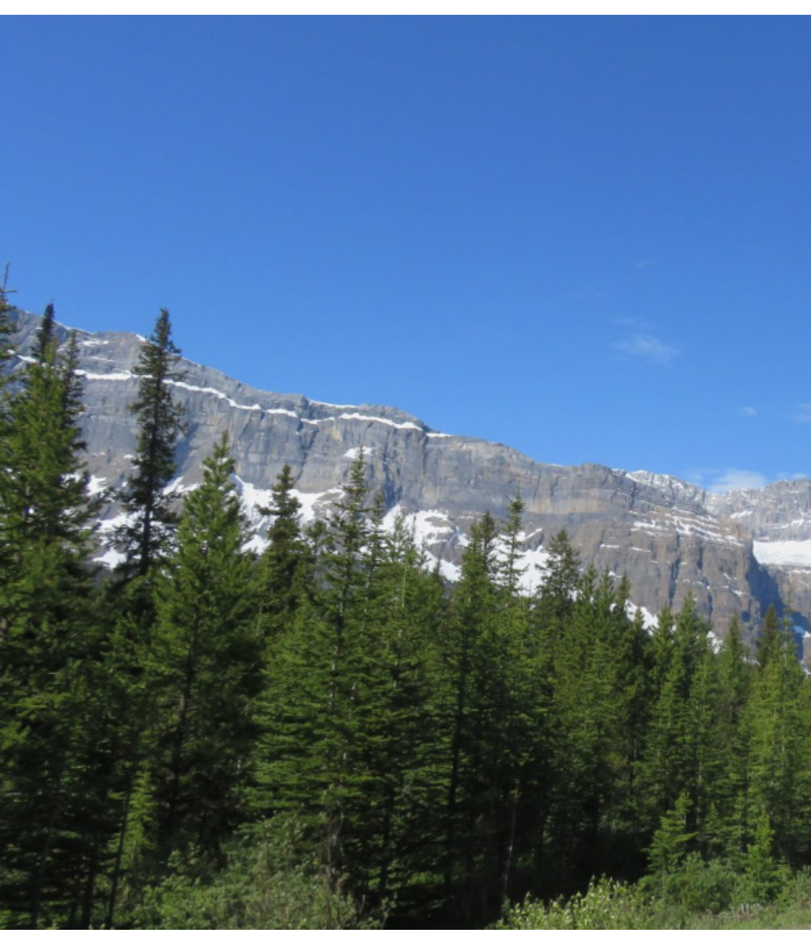
8-day Self-guided Motorcycle Tour of Canada's Ice Fields