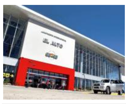
1 - La Paz - Uyuni - 0 Day 1 - LA PAZ . Transfer from airport.

In the morning we pick you up from the airport to the Hotel Oberland. After lunch (Lunch not included) we have a visit to the Moon Valley, about 16:00 pm. we have a short ride to get used to the motorbikes. http://www.hoberland.com