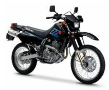
DR 650 + $0.00