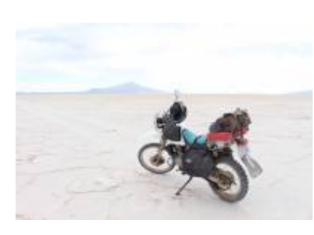
4 - Chulumani - Oruro - 295 Day 4 - Chulumani - ORURO (6 Hrs) (295Km).

100% dirt road. On this day, we'll be driving through a very warm valley over a dirt road with many slopes and curves. We'll arrive at the village of Chulumani 1,620mts, where we'll stay at a Hostal