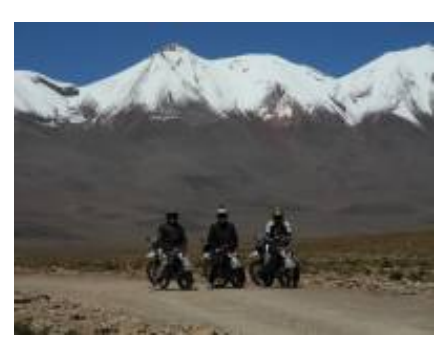
2 - Uyuni - Coroico - 135 Day 2 - LA PAZ - COROICO (6 Hrs) (135 Km).

In the morning we pick you up from the airport to the Hotel Oberland. After lunch (Lunch not included) we have a visit to the Moon Valley, about 16:00 pm. we have a short ride to get used to the motorbikes. http://www.hoberland.com