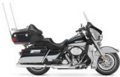
Road Glide Ultra Grand Touring Class + $590.00