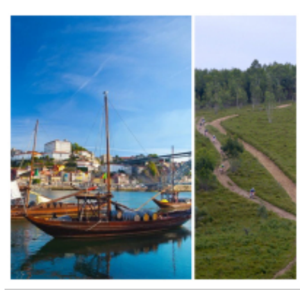
1 - Porto - Porto - 0 Arrival at Porto airport / Transfer to Basecamp / Group dinner (pending on flight arrival time)