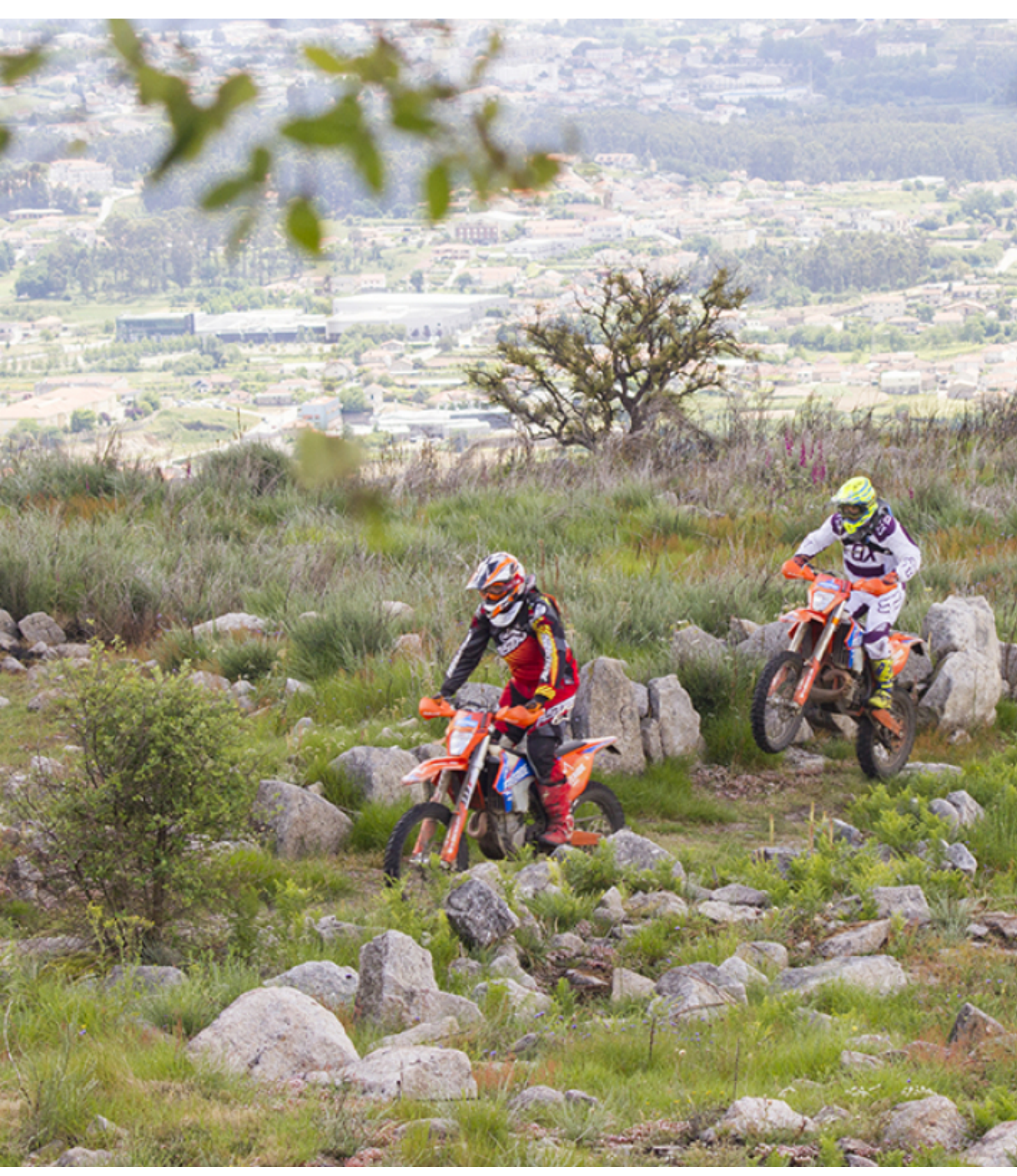
Motorcycle Enduro off Road Tour Tracks of Lagares, Porto, Portugal 4 days