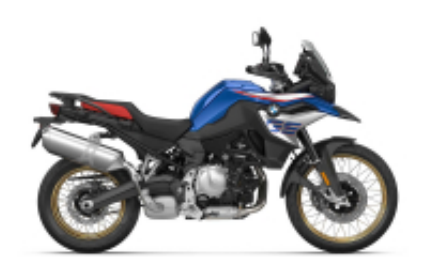
F 850 GS + $454.90