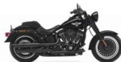
Fat Boy + $700.00