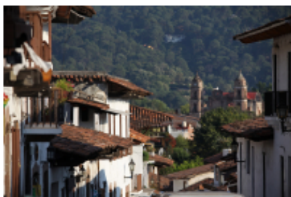
1 - Cidade do México - Puebla - 127 México City - Puebla (Van)