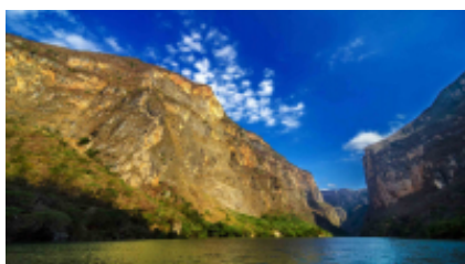
6 - Las Nubes - Palenque - 364 Las Nubes - Yaxchilan - Palenque