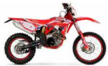
RR 430 4T + $0.00