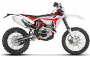
4t. 350 + $0.00