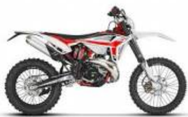
RR 300 2T + $0.00