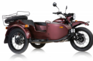
Sidecar + $0.00