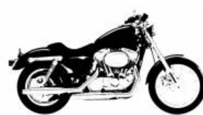
Rally 300 + $0.00