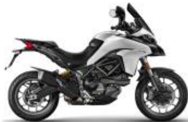
Multistrada 950 V2 + $379.19