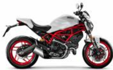
Monster 797 + $379.19