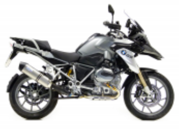
R 1200 GS LC + $273.99