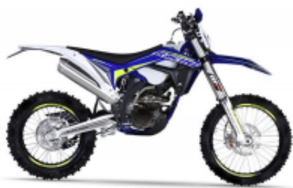
Sherco SEF 350 + $0.00