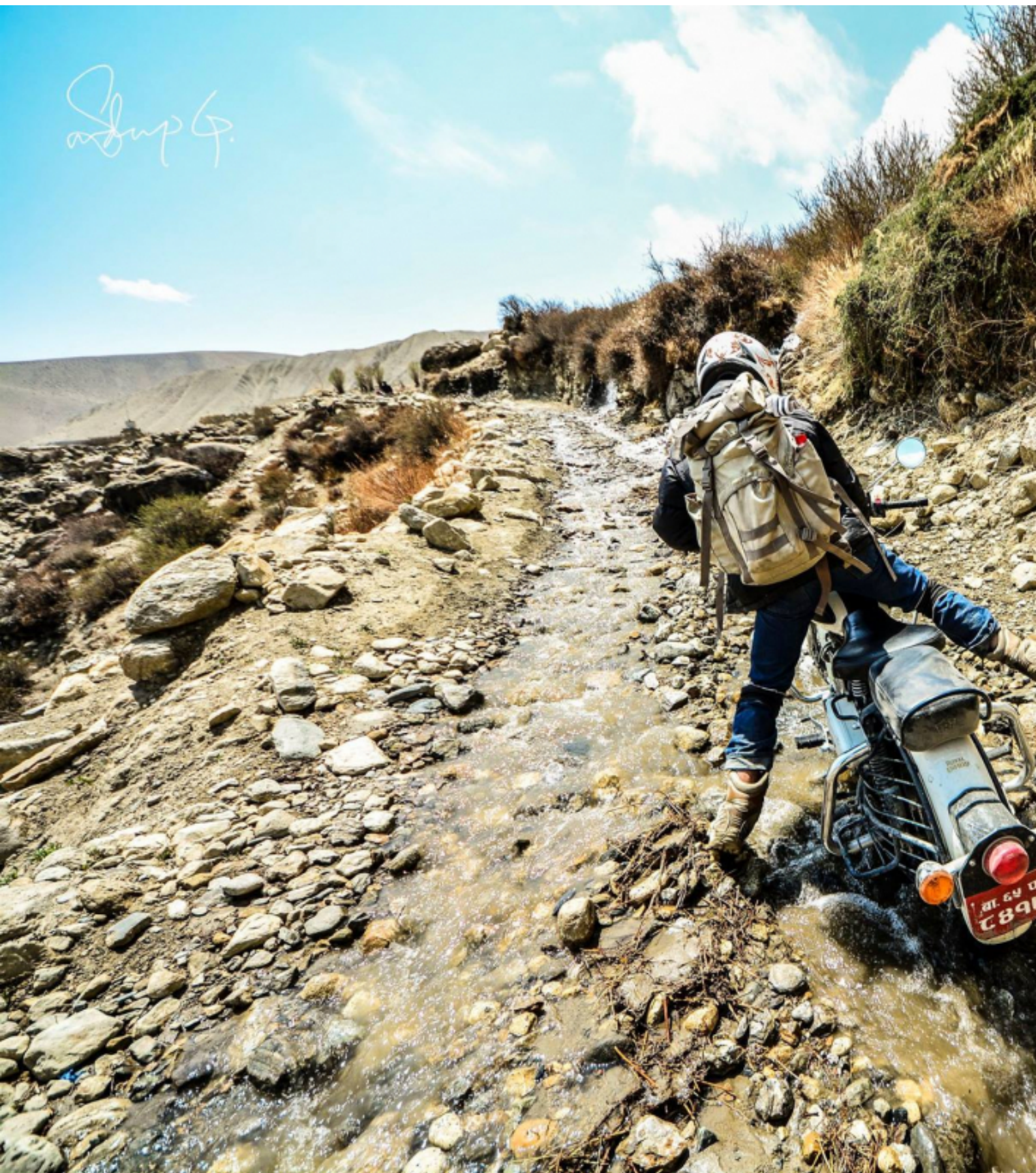
Motorcycle dual-purpose and Adventure Nepal, road to Mustang on Royal Enfield 350 cc