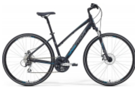
Crossway 20 Lady