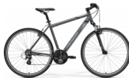
Crossway 20 Man