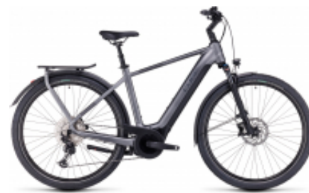
Touring Hybrid 500 One