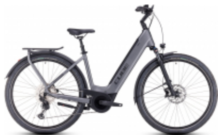
Touring Hybrid 500 Easy Entry