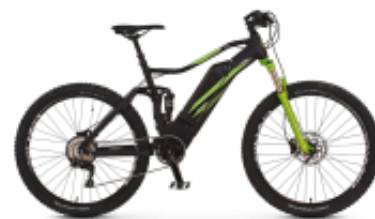
Graveller Sport Drive 10v 27,5 20.ETM.20