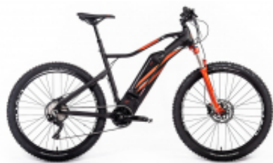
Graveler Sport Drive 10V 27,5 20.ETM.30