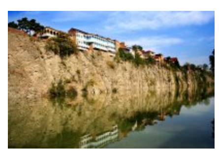
10 - Tiblissi - Tiblissi - 0 In the morning, departure to the airport for home.