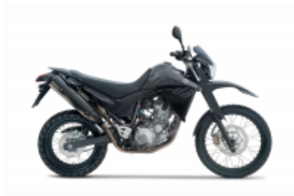
XT 660 + $0.00