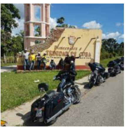
10 - Havana - Havana - 0

2:00 pm Return to Havana, Delivery of Motorcycles in our base in la Havana, in the evening Farewell Dinner at Local Restaurant, Hotel in Havana 4 stars. CP Plan