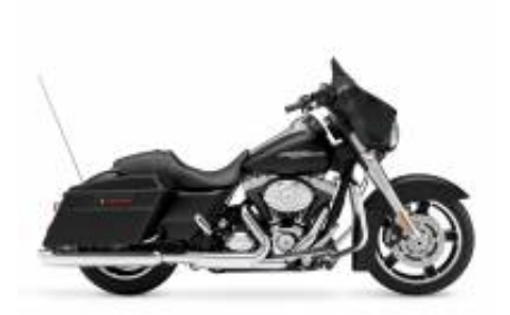
Street Glide + $0.00