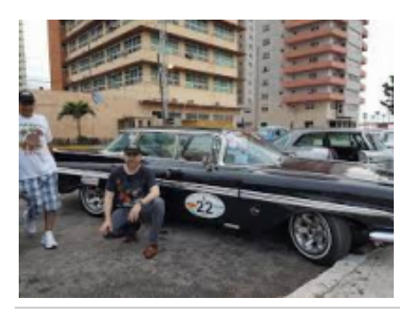
8 - Varadero - Varadero - 150

9:00 am Departure from Trinidad towards Varadero, crossing the mountain massif on the county road to Manicaragua, if road conditions allow in Santa Clara we will visit Ernesto Che Guevara square and where the mausoleum that keeps its remains and those of its fallen fighting partners in Bolivia in 1967, Lunch at Local Restaurant, after lunch we continue the trip to Varadero (Approximate distance traveled in the day: 330 Km). Hotel in Varadero 4 stars. T Plan