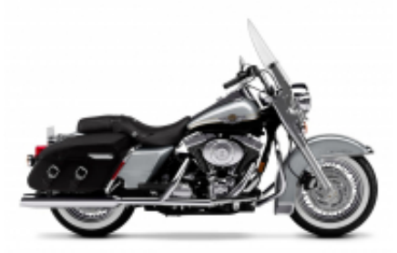
Road King + $0.00