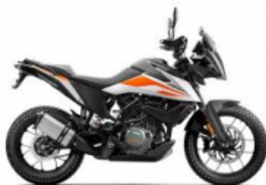
390 Adventure + $0.00