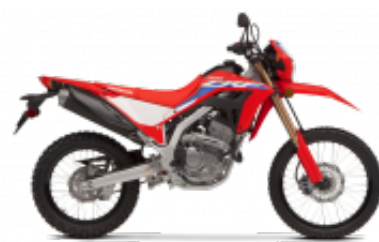
CRF 300 L + $0.00