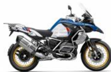
R 1250 GS Adv LC + R$ 967,37