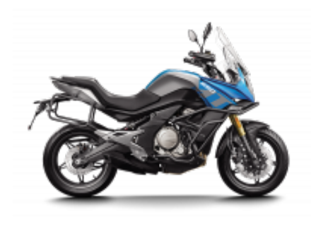
650MT 2022 + $1,146.77