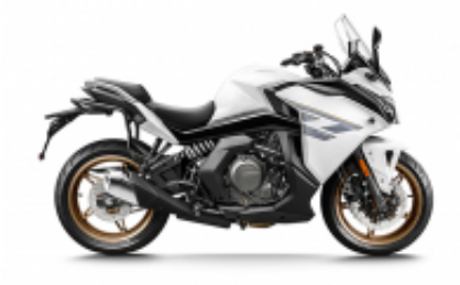
650GT + $1,146.77