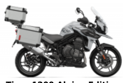
Tiger 1200 Alpine Edition + $2,190.45