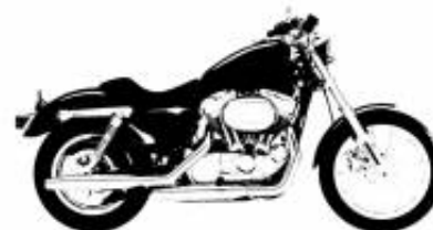
R 18 Transcontinental + $0.00