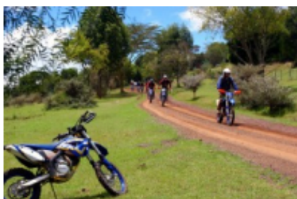
6 - Maasai Mara National Reserve - Loyk Mara Camp - 120 km