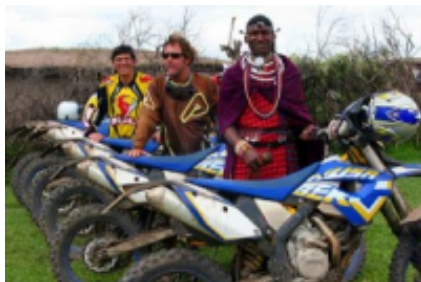
1 - Nairóbi - Nairóbi - 0 km