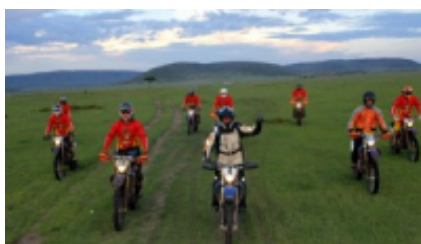
2 - Nairóbi - Soysambu - 220 km