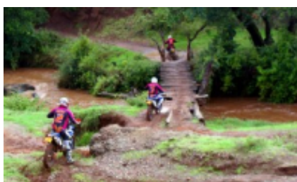
3 - Soysambu - Kericho - 200 km