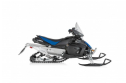
Viking 700 + $0.00