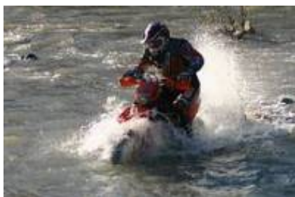
5 - Karapınar - Güzelyurt -