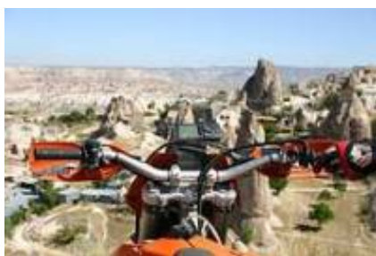
3 - Akseki - Taşkent -