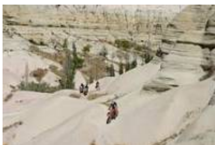
6 - Güzelyurt - Göreme -