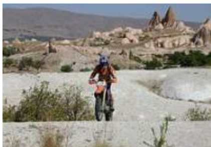
2 - Antalya - Akseki -