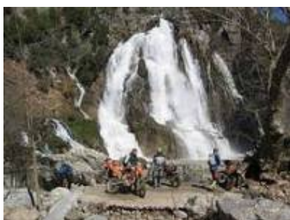
4 - Taşkent - Karapınar -