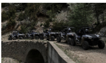
3 - Errachidia - Errachidia -