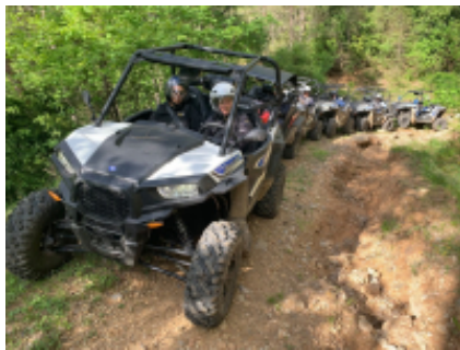
1 - Errachidia - Errachidia -