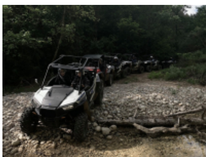
4 - Errachidia - Errachidia -