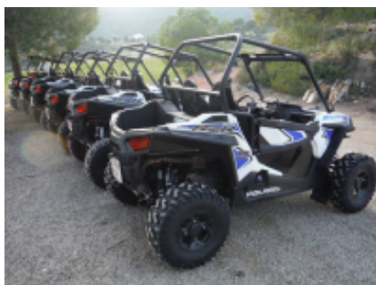
2 - Errachidia - Errachidia -