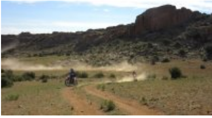
7 - Jargalant - Ulaanbaatar - Return to Ulaanbaatar.