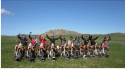
8 - Ulaanbaatar - Ulaanbaatar - Depart.