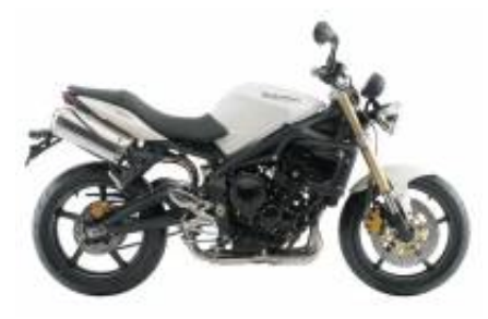
Street Triple 675 + $700.00