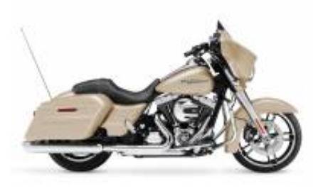
Street Glide Special + $700.00