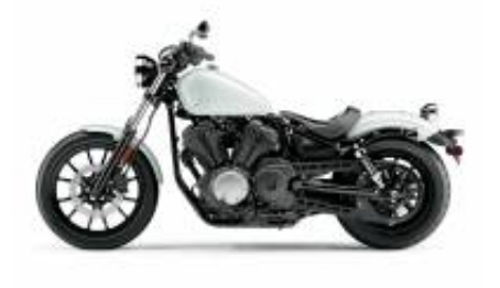
XV 950 Bolt + $700.00