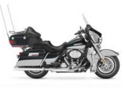
Road Glide Ultra Grand Touring Class + $700.00