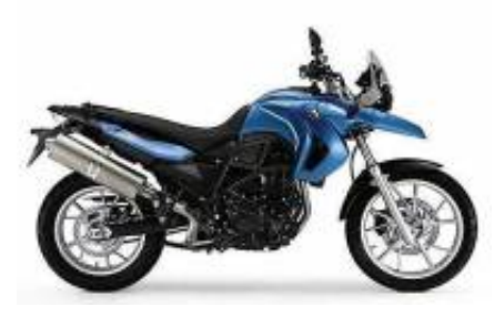
G 650 GS Twin + $700.00