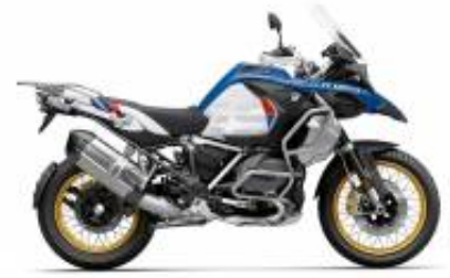
R 1250 GS Adv LC + $199.07