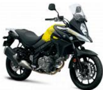
DL 650 V Strom + $0.00