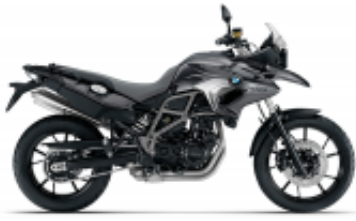
F 700 GS + $205.47