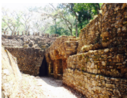
4 - Palenque - San Cristobal de las Casas - 213 Palenque - San Cristobal