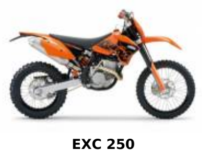
EXC 250 + $0.00