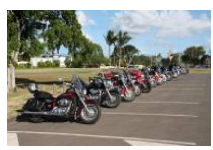
9 - Blue Mountains - Hunter Region -