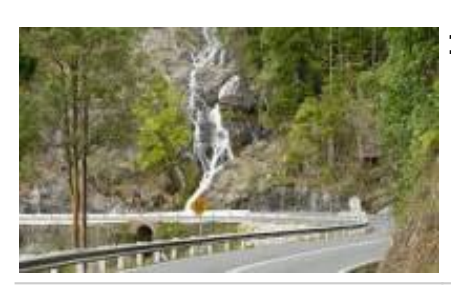
11 - Armidale - Waterfall Way -