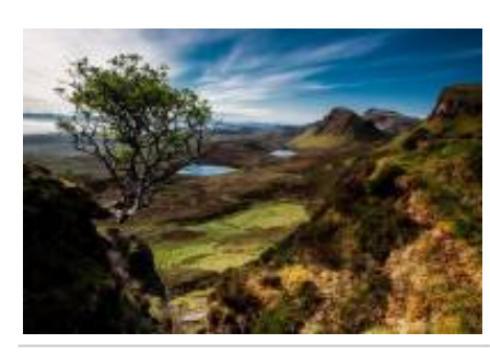
8 - Sydney - Blue Mountains -