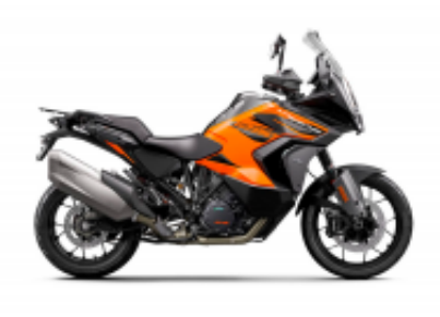
1290 Super Adventure S + R$ 0,00